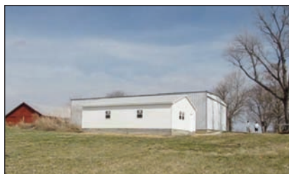
Unfinished Intake Building